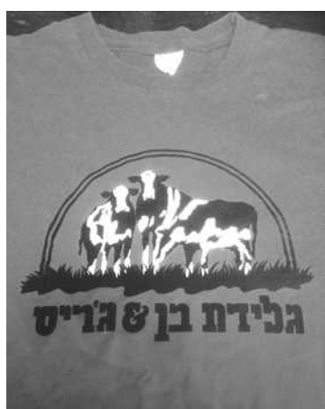
"Gelidat Ben & Jerry": An Israeli T-shirt, our 2nd prize.